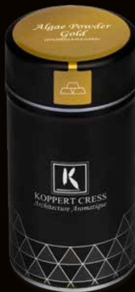
Algae Powder Gold (Chlorella Vulgaris)

This algae powder is from the Chlorella genus and were first discovered in the canals of Delft, the Netherlands by M.W. Beijerinck in 1889. There are over a hundred varieties of this algae, making it possible to select specific types of Chlorella for their aromatic and visual properties. Algae can become