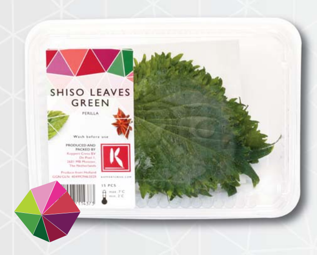
Content: 15 leaves per tray

Produced in a socially responsible culture, Shiso Leaves meet the hygienic kitchen standards. The products only need rinsing, since they are grown clean and hygienically.